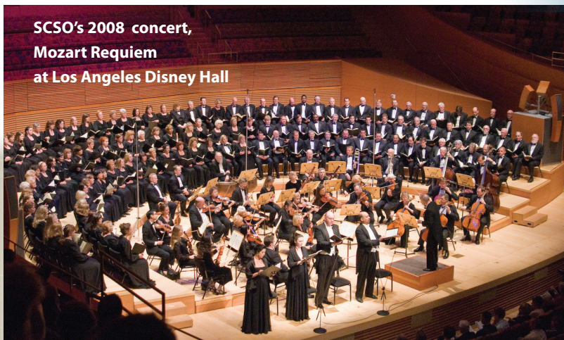
SCSO's 2008 concert, Mozart Requiem at Los Angeles Disney Hall

After 20 years of performing in the Sacramento Community Center Theater, the SCSO is both proud and excited to be making our debut in the new SAFE Credit Union Performing Arts Center. With improved acoustics and highly upgraded amenities, the new hall promises to offer a joyful and uplifting musical experience for both performers and audience members alike.